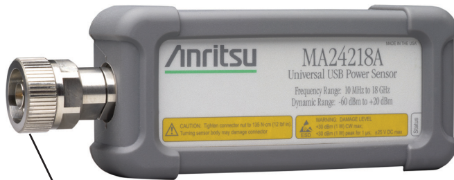
N Type connector designed for use with a torque wrench ensuring repeatable connections