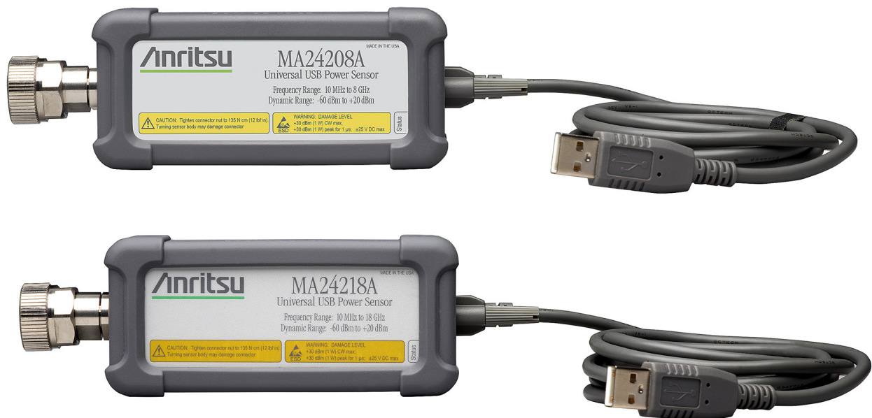
MA24208A and MA24218A Universal USB Power Sensors