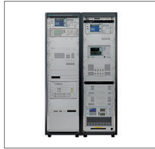
New Radio RF Conformance Test System ME7873NR