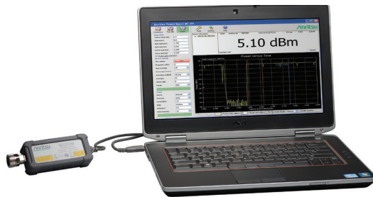
Control your sensor with the PowerXpert™ Software Application