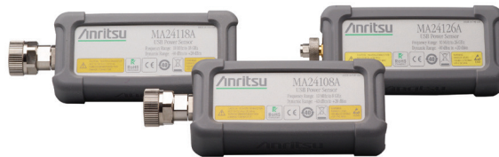
Microwave USB Power Sensors